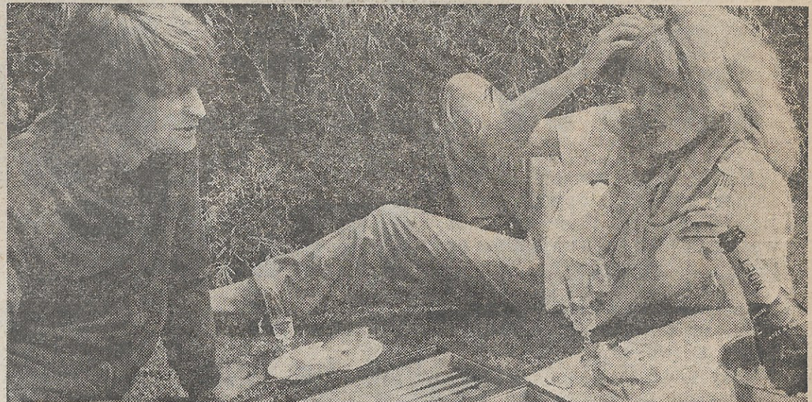
After work... a quiet picnic for David and Joanna, stars of "Sapphire and Steel"

It's more of a mystery than science fiction; written by P. J. Hammond it centres